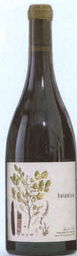
PROFOUND PINOT Antica Terra's Botanica bottling has a remarkably silky texture.